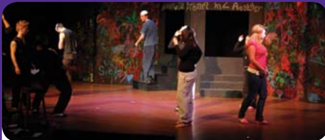
Edwina Porter Theatre