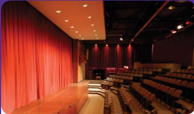
Adrian Mann Theatre